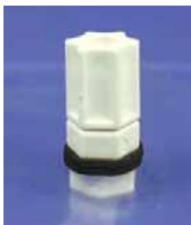
Teflon Faced Septum