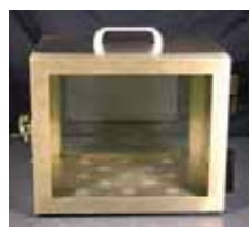
Plate Drying Rack

Featuring a carrying handle, this 20 gauge stainless steel cabinet has a removable desiccant tray and gasketed door with positive lock door latch. This unit holds a stainless steel drying rack, (not supplied with unit). Cabinet measures 25x25x30cm (DxWxH)